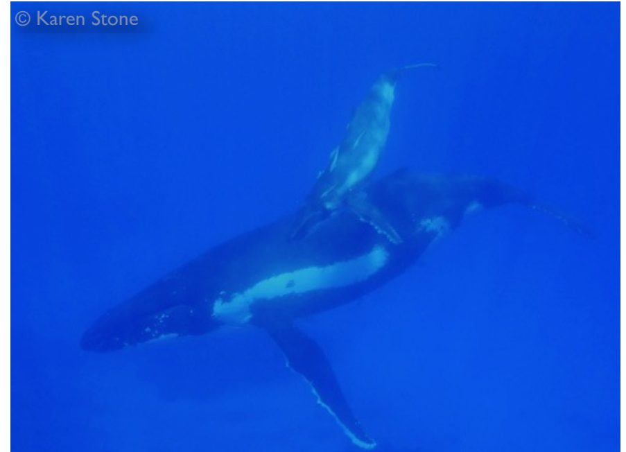
03 October: Around White Patch, toward North Bay.