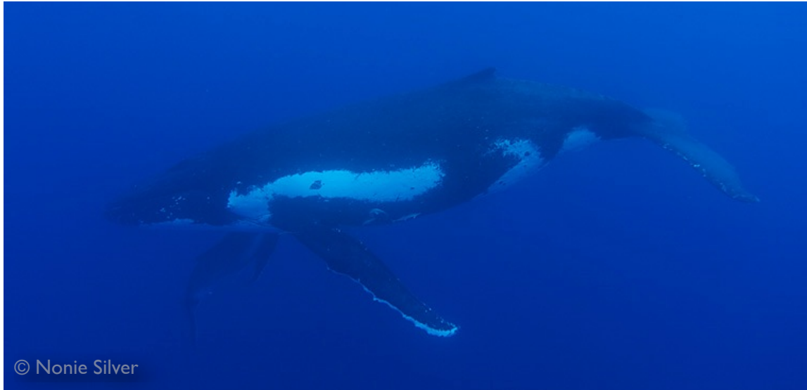
02 October: Near Taunga. ( Blog Post )