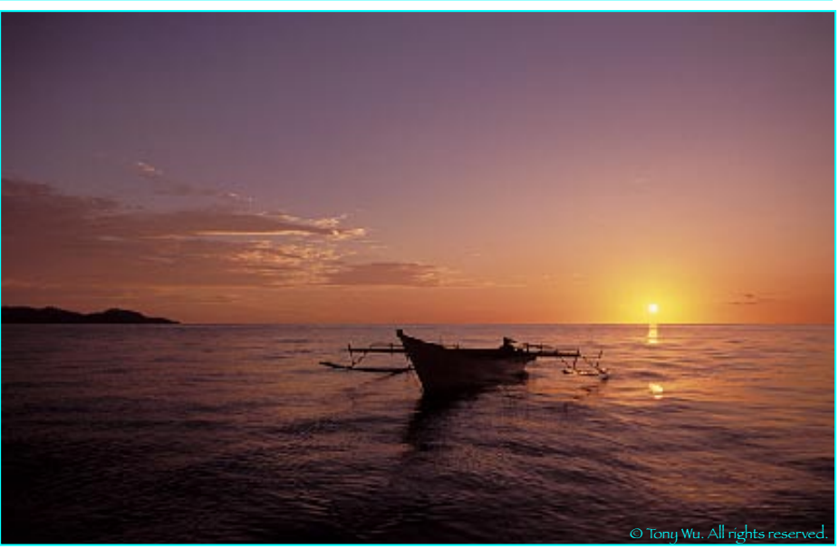
Anceng's boat: Intended for two, a tight fit for the five of us!

On the whole, it would be much easier and preferable in my view if tuna, marlin, large sharks and the like visited shallow waters more often to pose for pictures, but alas, this