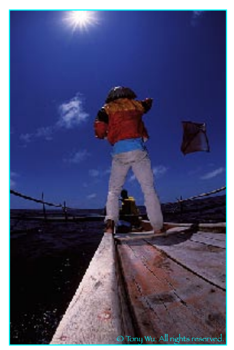
Launching a kite to catch fish?!

One of the many intriguing things I came across tucked away in the nooks and