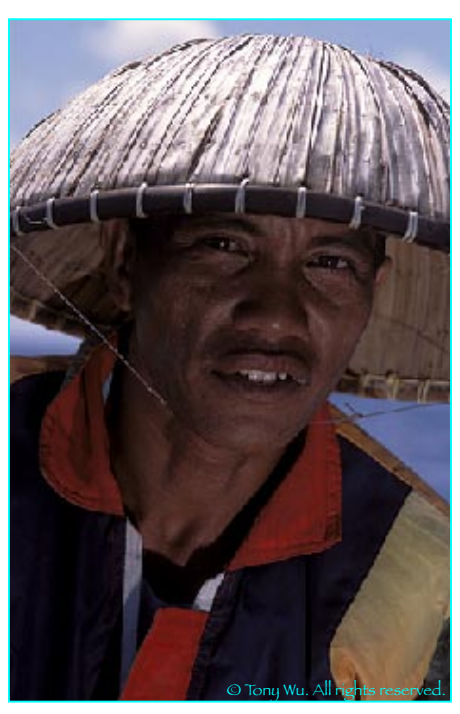
The look of a seasoned fisherman

"When it happens, I stay inside and wait for the storm to pass. There are lots of boats, so I usually get picked up."