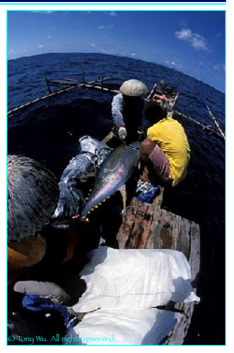
Landing a yellowfin tuna.

Several attempts later, it happened. A forty-kilogram yellowfin tuna leapt two meters out of the water and struck.